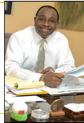
Commissioner Raymond Buxton, II

Si usted piensa que ha sido discriminado en la vivienda o en el empleo, debe ponerse en contacto con la Comisión de Asuntos Humanos. La Comisión investigará su queja y si hay una violación de la ley, la Comisión puede ayudarlo a conseguir soluciones legales a los que usted tiene derecho. Si es necesario, la Comisión puede llevar casos de discriminación a una audiencia o a la corte. No importa su estado legal, la Comisión lo ayuda.